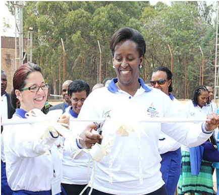
First Lady Mrs. Kagame officially opening International Women's Congress– Huye District

At the occasion Mrs Kagame urged women to strive for these 6 virtues: Character, Humility, Obedience, Servanthood, Enlightenment and Nobility.