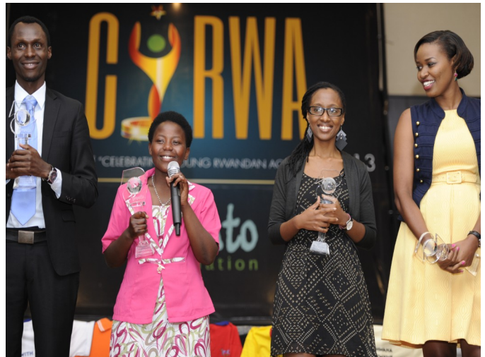
2013 Young Rwandan Achievers just after being awarded

To date, 29 youth have received the CYRWA award.