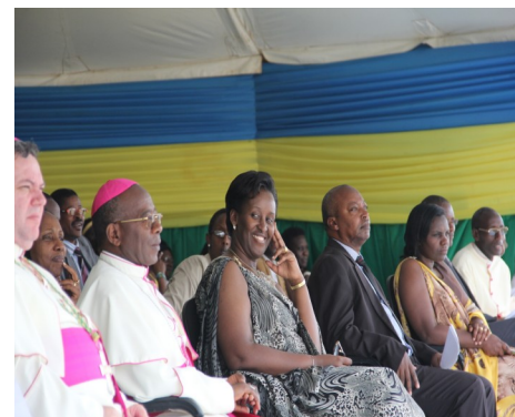
Mrs. Kagame with Government and church leaders at Mushaka Parish