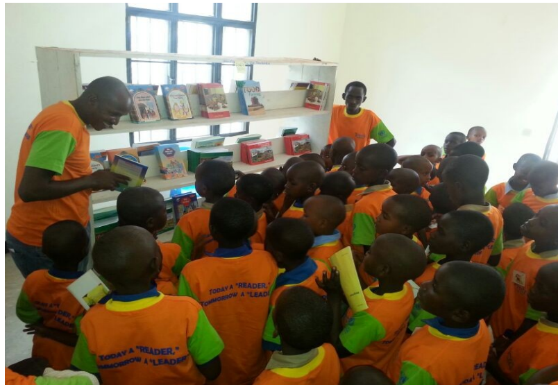
Children at a library in the Southern Province of Rwanda

This year Imbuto Foundation has impacted 600 primary school children and 300 parents, through the reading initiative. At each annual reading event, reading competitions are held to keep students motivated and challenged.