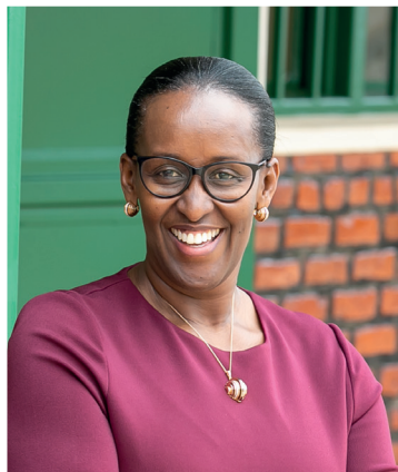
Her Excellency Mrs Jeannette Kagame First Lady of the Republic of Rwanda and Chairperson of Imbuto Foundation

The First Lady of the Republic of Rwanda, Mrs Jeannette Kagame personifies an active, relentless and passionate devotion to uplifting the lives of vulnerable populations in Rwanda; particularly those of widows, orphans of the genocide and disadvantaged families. As the nation's First Lady, Mrs Kagame has admirably balanced family, social life and philanthropy, not only in her own country but continentally, and worldwide.